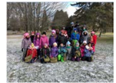
Grade 4's at Sibbald Point!